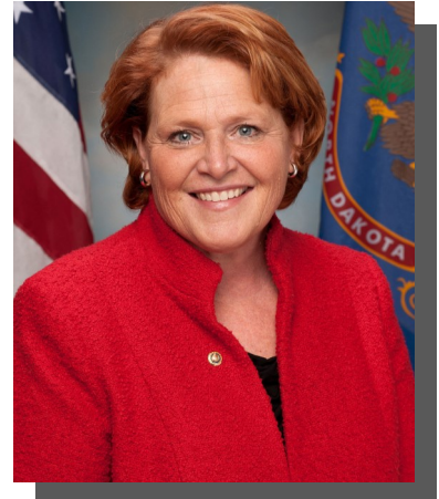
Heidi Heitkamp United States Senator North Dakota

“Today is also a major win for trafficking victims and their families — they deserve an immense amount of credit for their bravery to stand up and fight back — along with the tireless efforts of victims advocates — they simply said, ‘no more,’” Heitkamp said in a statement after Trump signed the bill. “For far too long, trafficking victims were deprived justice against websites like Backpage.com that knowingly enabled this form of modern-day slavery and profited off victims’ pain. These websites will now face punishment for their disgusting role in facilitating this vile trade.” - Source: Williston Herald, April 2018