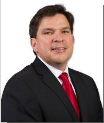
Vicente Gonzalez United States Congressman 15th District, Texas

The grant for Texas Rio Grande Legal Aid Inc. comes from the DOJ's Office of Victims of Crime-Human Trafficking and is