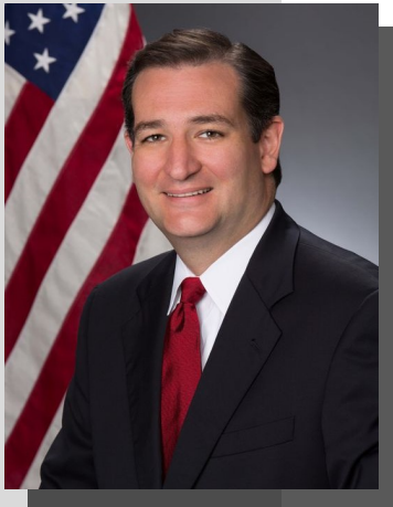
Ted Cruz United States Senator Texas

“Today is also a major win for trafficking victims and their families — they deserve an immense amount of credit for their bravery to stand up and fight back — along with the tireless efforts of victims advocates — they simply said, ‘no more,’” Heitkamp said in a statement after Trump signed the bill. “For far too long, trafficking victims were deprived justice against websites like Backpage.com that knowingly enabled this form of modern-day slavery and profited off victims’ pain. These websites will now face punishment for their disgusting role in facilitating this vile trade.” - Source: Williston Herald, April 2018