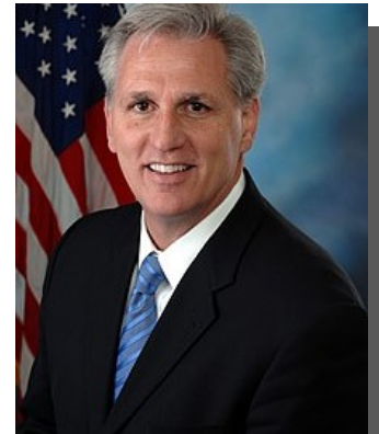
Kevin McCarthy United States Congressman 23rd District, California Majority Leader, US House of Representatives

"As true as it is sobering, this young woman's story is far from isolated. It is repeated, frequently with even more disturbing details, in towns and cities across our nation. Children are sold on the black market. Young women are forced into prostitution. Immigrants are pressed to work for little or no wages. Each and every one is an affront to our human dignity, our basic freedoms and our common call to care for, not abuse, those who are vulnerable and in need. " Source: CNN, May 2017